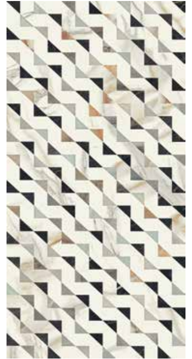
24x48 trilusso deco POLISHED