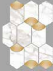
copper hex POLISHED