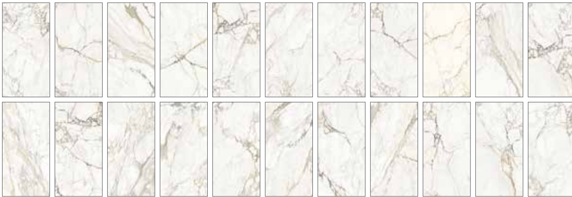
satin: ELELUOR2448 polished: ELELUOR2448L