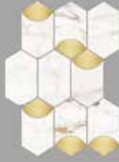
gold hex POLISHED