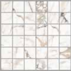
2x2 mosaic SATIN