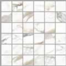
2x2 mosaic SATIN